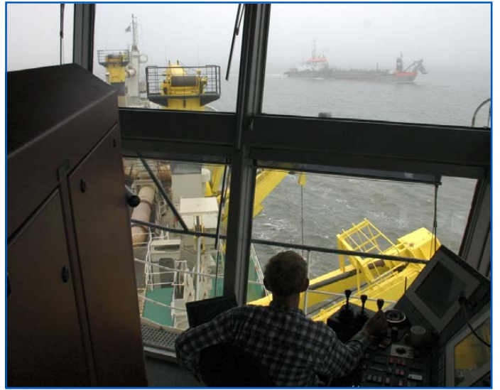
Installation of sheet piles and trenching by TSHD "Argonaut".