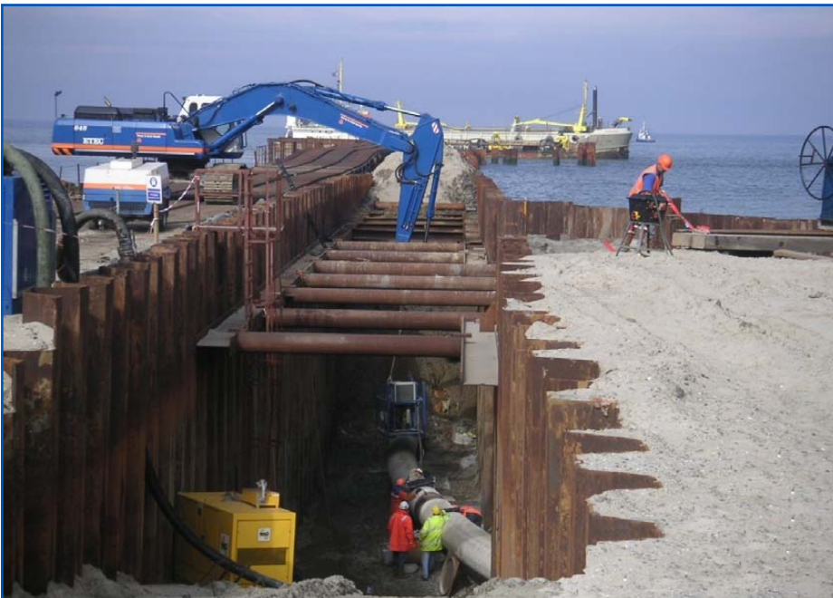
Tie-in pit and TSHD "Sospan Dau" backfilling.

The project was completed under typical, unstable, North Sea conditions, but nevertheless to client's complete satisfaction.