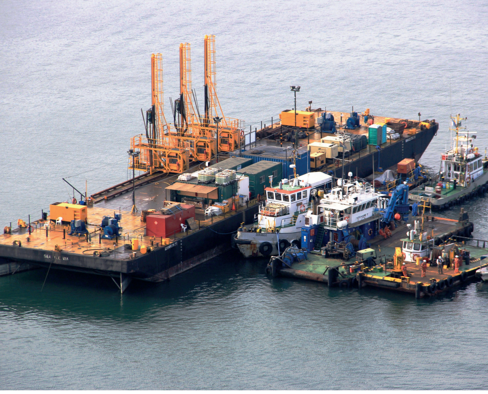
Cuyutlan, Mexico - Drill barge alongside support vessels