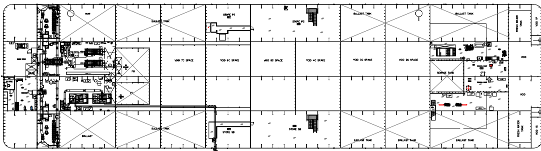
TOP VIEW ENGINE ROOM LEVEL