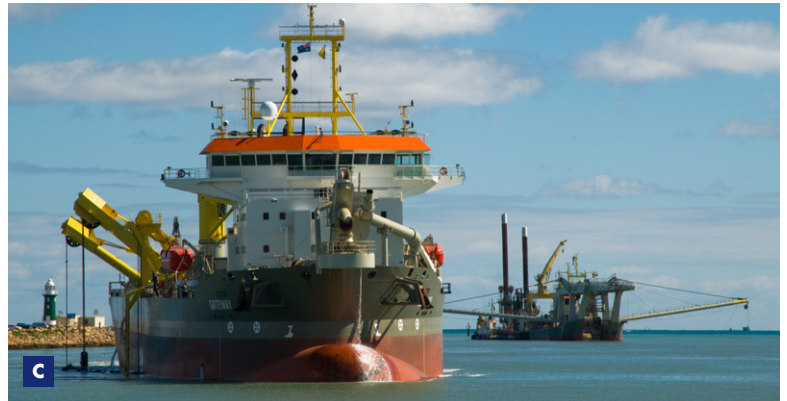
C TSHD Gateway and CSD Phoenix D Aerial view January 2010

Dredging started early January 2010 and ended in November 2010. In total over 2,000,000 m 3 of material was dredged from the Inner Harbour. Approximately 1,332,000 m 3 (net) of sand was used in the reclamation site at Rous Head. Approximately 715,000 m 3 (net) required pretreatment (crushing) with a Cutter Suction Dredger (CSD) prior to removal using a Trailing Suction Hopper Dredger (TSHD). This material was placed into the offshore spoil ground. The project was executed in separate stages.