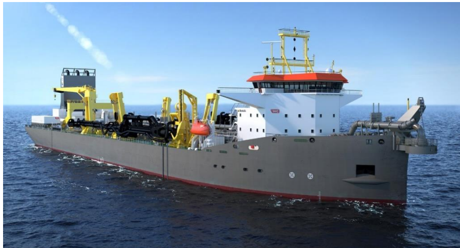
Artist's impression of the new Boskalis trailing suction hopper dredger

Boskalis has signed a contract with Dutch shipbuilding company Royal IHC to build a large state-of-the-art trailing suction hopper dredger. The award of the contract follows an extensive design phase. The vessel will have a hopper capacity of 31,000 m 3 and will be built at the IHC yard in Krimpen aan den IJssel, the Netherlands, over the next few years.