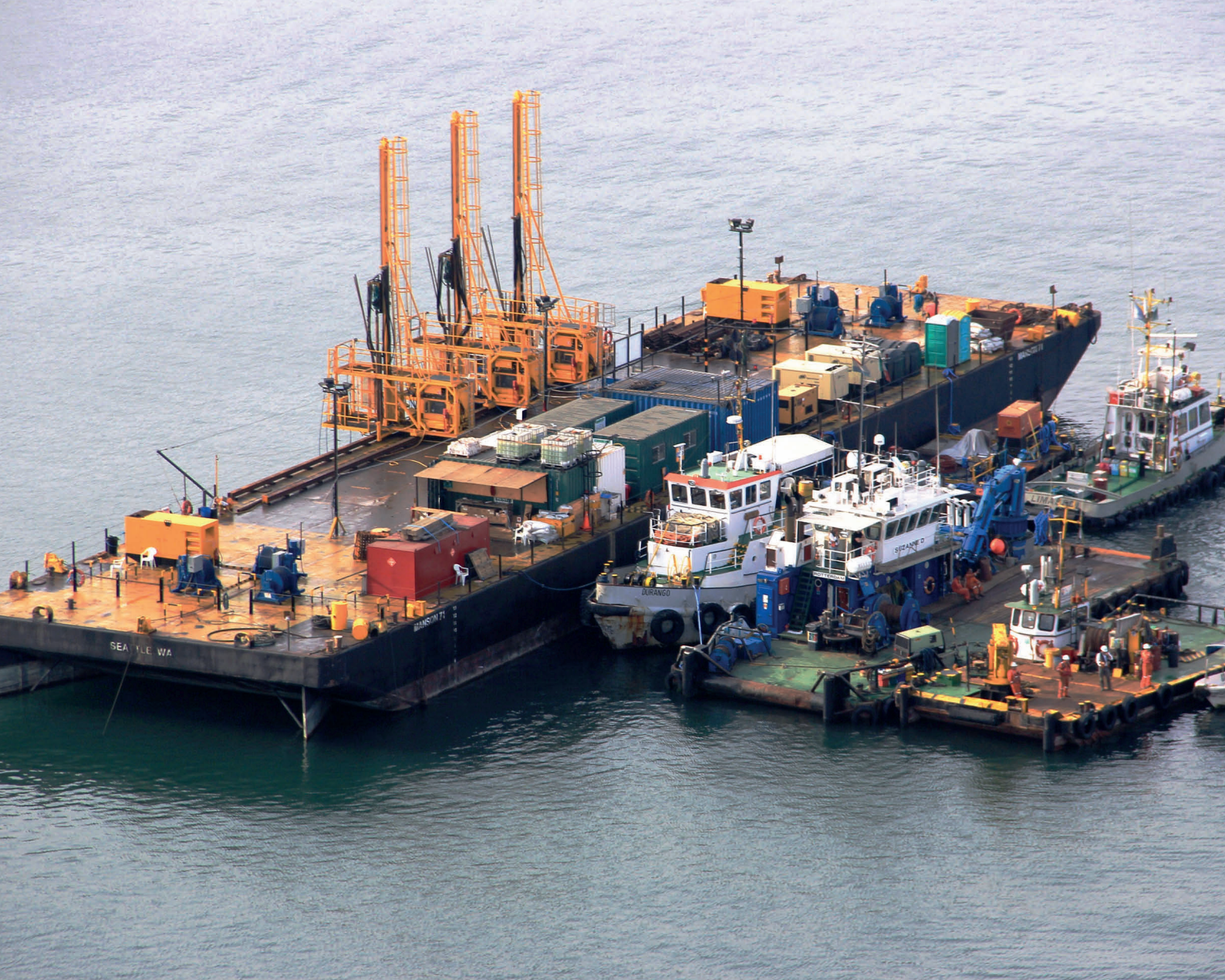
Cuyutlan, Mexico – Drill barge alongside support vessels